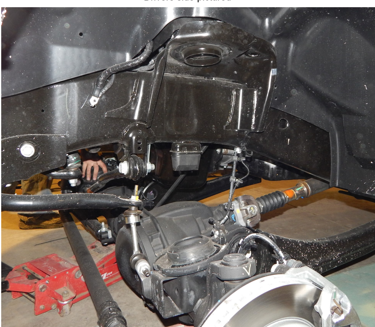
Drivers side pictured