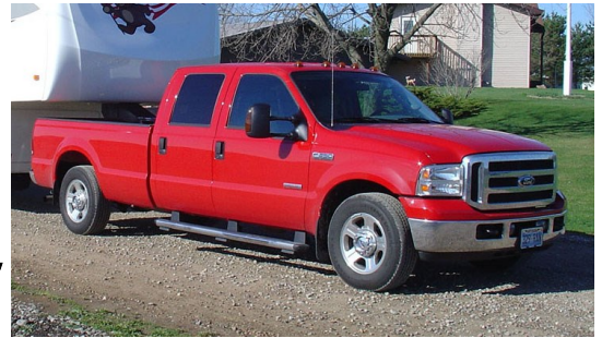
2005 & newer Ford Front