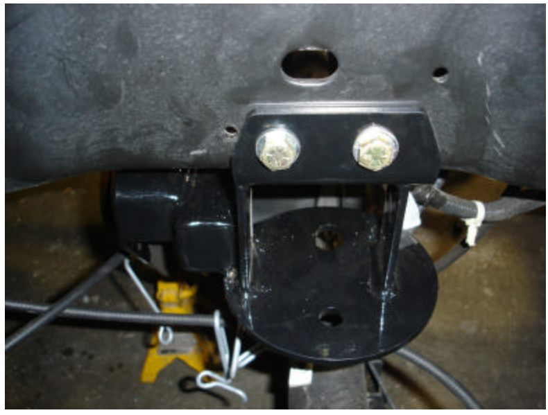
Step 12 . Locate the sway bar mounting brackets. These U-bolt to the bottom of the axle. On the 2008 models, you will need to drill the hole in the bottom of the axle perch. Use the 7/16" x 1" bolt to fasten together. Next locate the sway bar, blue bushings and sway bar clamp. Figure out where the blue bushings will locate on the sway bar, lube the inside of the blue bushing and slide the blue bushing over the sway bar. Next slide the clamp over the blue bushing and fasten the sway bar to the sway bar mount. Use the extended nuts and washers to fasten into place. You install the end links once the truck is aligned.