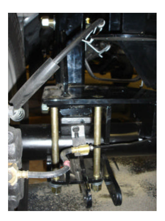
Step 5. Locate the front lower trailing arm mount. Hold the mount against the side of the frame and match up the holes. Most of the holes will be smaller will be necessary to drill the holes in the bottom and sides of the frame. Use a ½" drill or slightly larger. On the drivers side, it is required to lower the fuel tank and slide it over towards the center of the truck. NOTE: Be sure to use extreme caution when drilling around the fuel and brake lines. Once you have the holes all drilled, tighten the 1/2" bolts. Torque the 1/2" bolts to 75 ft/lbs.