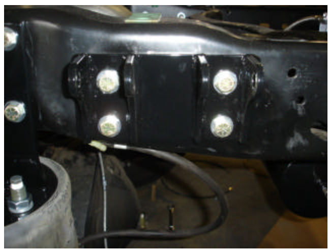
Dual shock mount pictured