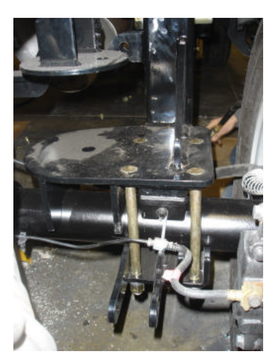
Step 4. Locate the lower air bag mount and the lower axle clamps. The passenger side lower air bag mount is the one with the two tabs welded to it. The bottom axle clamps are also the lower shock mounts. Place the lower bag mounts on the top of the axle leaf spring perches. Use the 5/8" x 8 1/2" bolts to fasten components into place. Make sure to run the bolts in from the top down (nuts on the bottom). The bottom shock mounts should be mounted so the ears are toward the inside of the frame. Torque the 5/8" bolts to 150 ft/lbs. Make sure to tighten in a criss-cross pattern to make sure the lower bag mount sits flush on the leaf spring pad. NOTE: You will have to slightly bend the metal brake lines that run across the back of the axle. Be careful and don't kink the brake