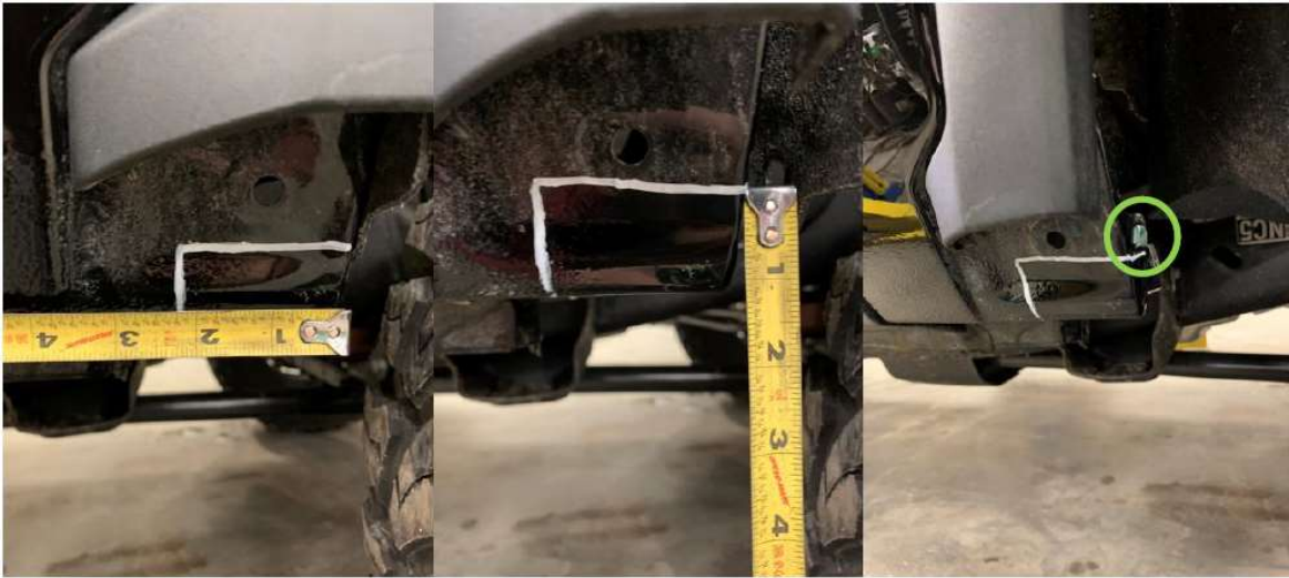
Figure 3: Metal removal necessary for cap install (2 1/4" x 1 1/8")