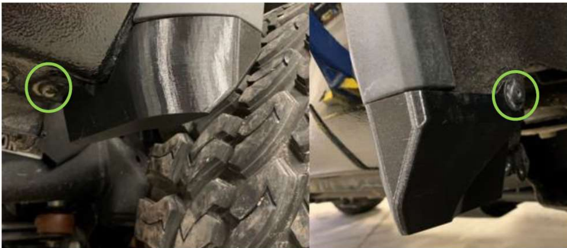
Figure 4: Kelderman fender flare cap installation points